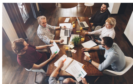
Helping Teachers Grow